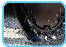
Hydraulic scraper blade