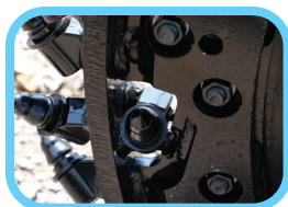
Interchangeable tooth plate kits, cutting widths from 2" to 8"