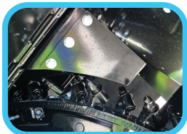
Material flow diverter