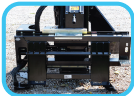
Hydraulic side shift 0" — 18"