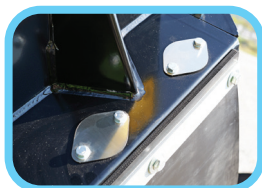
Predrilled holes for optional water tank