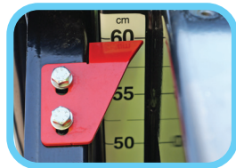
Depth gauge provides uniform depth for cut control