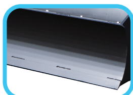
Integral knock-down blade for efficient material handling