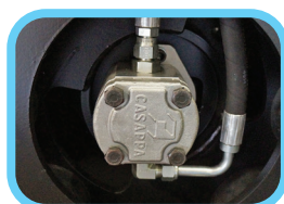
Protected drive motor enclosed in heavy duty steel frame