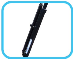
2 1/2" x 48" Hydraulic Cylinder

Built from heavy-duty steel tubing and powered by a 2½" x 48" hydraulic cylinder, the Roof Truss Jib delivers dependable lifting performance with capacities up to 1,200 lbs retracted and 500 lbs fully extended. Complete with hydraulic hoses, couplers, and a universal skid steer mount, it offers a versatile and cost-effective solution for high-reach lifting tasks.