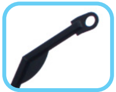
2 1/2" hole for chains, hooks, and straps