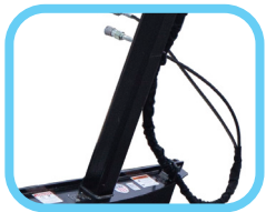
Heavy duty 4" x 4" x 3/8" main boom tubing