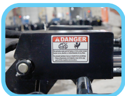
Protected cylinder covers