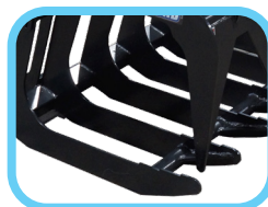
5/16" steel tines