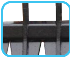
Reinforced frame tubing for enhanced strength