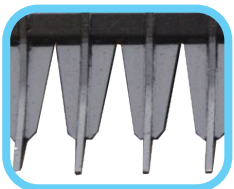
5 1/4" tine spacing for efficient soil & debris flow