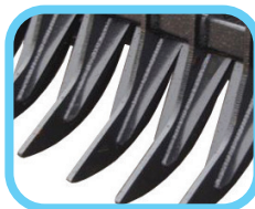
5/8" thick steel tines for extreme durability