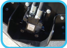
Protected direct drive motor