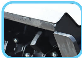
Solid round tube for strength