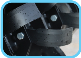
Double edge replaceable tines