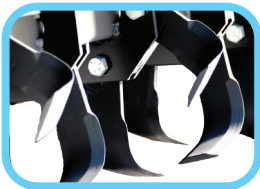
Double edge replaceable tines