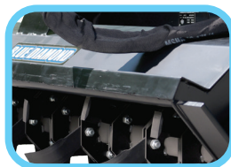
Solid round tube for strength