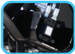
Protected direct drive motor