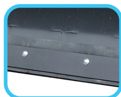
Rubber cutting edge