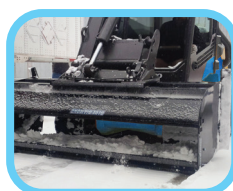
Pull-back option available