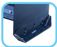
Bolt-on wear shoes