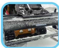
Pull-back option available