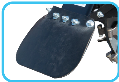
Shield protects from flying debris