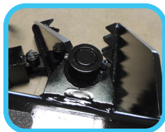
Heavy pins and bushings at all pivot points