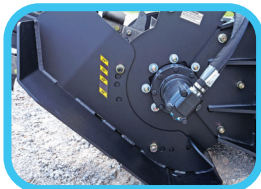
Adjustable skid foot keeps trench depth constant