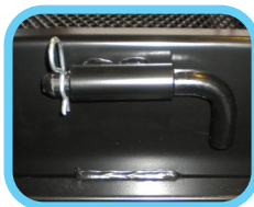
Safety pins secure side railings and doors