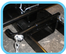
Fork tine safety pin