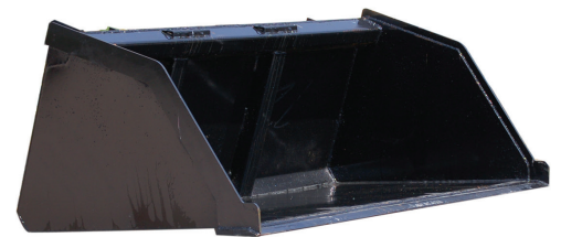
38"D X 26"H